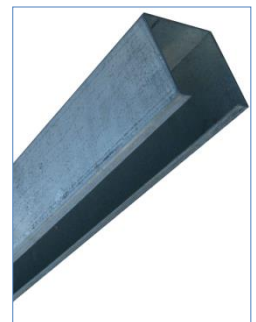
Galvanized Steel Post Insert