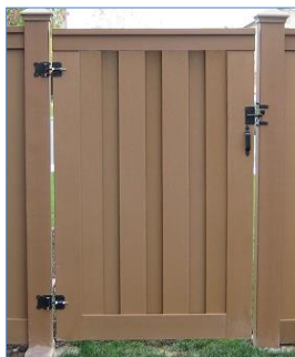
Standard gate (same look both sides)