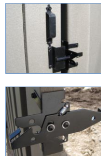
Handle and Latch