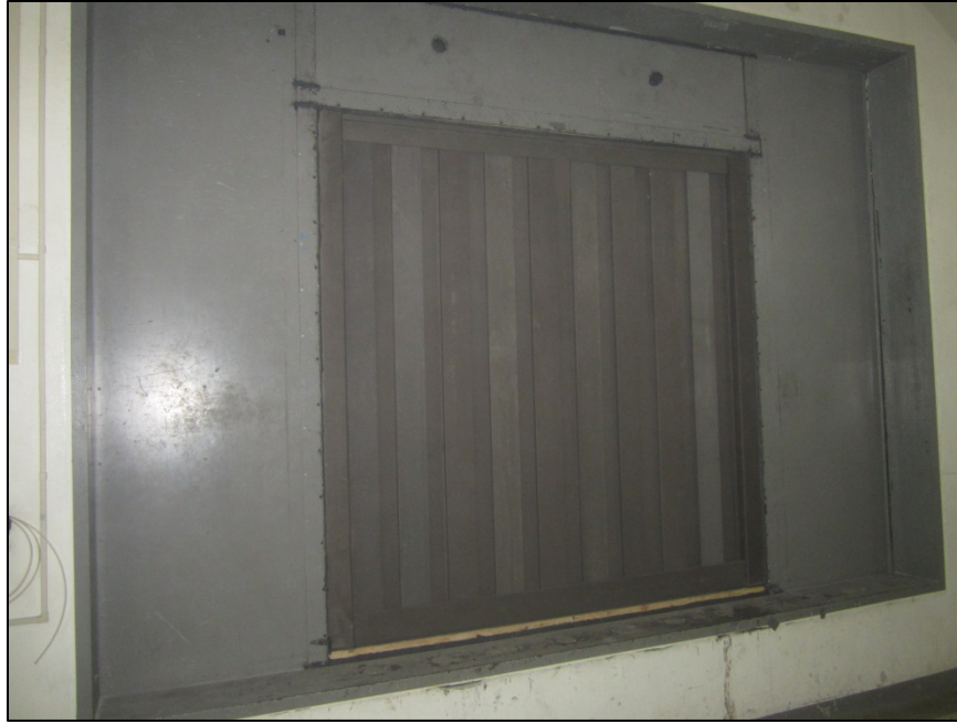
Receive Room View of Installed Specimen